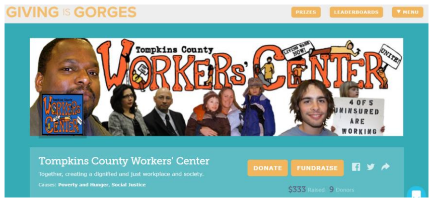
What is Giving is Gorges?

Giving is Gorges was established by a collaborative group to celebrate the spirit of philanthropy in Tompkins County and surrounding areas. The purpose of this powerful giving experience is to unite our community members around causes in which they truly believe and help support local nonprofit organizations. On June 1, we all will collectively embrace new tools and strategies that generate excitement and multiply resources for organizations doing great work all over Tompkins County. This is a unique opportunity to highlight how we can work together to share commitments and build a stronger sense of community.