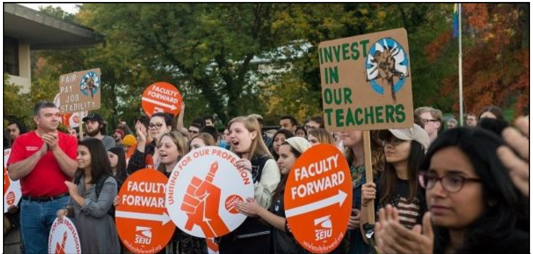
Students, organized labor, the Ithaca College and larger Tompkins County community gather outside IC Board of Trustees meeting to protest the Board's unwillingness to give more to IC Contingent Professors.

unionized. They are not paid a living wage and the colleges are desperate to keep them as a low-wage faculty workforce.