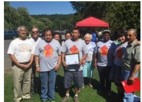
Members of the Worker Justice Center of NY and the Workers' Center of Central NY alongside Members of the Tompkins Workers' Center and the Mid-state Council on Occupational Safety and Health after receiving the Joe Hill Award.

kins/Cortland Labor Committee are working together to build a local labor movement that brings both organized and unorganized workers together as a unified community movement. Internal organizing is taking place both within non-union workplaces as well as to more strongly mobilize already unionized workers. Stay